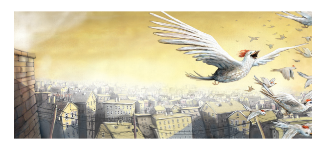
Ill. 4. Aisato, Fugl 2013.

and psychological complexity. Though the pictures are unsettling, the overall message is positive with a happy ending, at least for the girl (doublespread 15; see Ill. 4). The motif of the metamorphosis thus becomes the symbol of the child's empowerment and her ability to change her fate. The book reflects and reinforces the view of the child as both a vulnerable and a competent actor. It provides hope for the lonely, ill-adjusted child—escape is possible. As the book cover states, "sometimes, if you really, really wish for something, strange things can happen ..." (Aisato 2013; my translation).<sup>13</sup> Colomer's idea that the psychological turn is part of a wish to provide children with psychological defense might reflect the authors' intentions. However, what are the underlying ideological consequences?