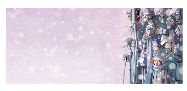
Ill. 6. Aisato, Fugl 2013.

By emphasizing the social aspects of Aisato's book, it can be read as a harsh critique of society. As we have seen, the girl's transformation can be understood as empowerment, giving the child the opportunity to escape, and thus, following Colomer, the book can be said to prove psychological defense. However, the motif of metamorphosis seems to denote both change and immutability at the same time. The girl can change, but society can't. In fact, the dystopia in Fugl reaches its climax at the end of the book. The last doublespread displays the grandfather alone, looking at the sky. The text reads as follows: "Every winter, if you are in this town, near the old house in the garden, you can see a grandfather sitting on top of a naked tree" (Aisato 2013; my translation). 15 Here, the iconotext's symmetry enhances the notion that the grandfather is left behind. By describing the tree as naked, the text underlines the grandfather's loneliness. The back