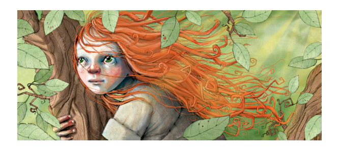
Ill. 2. Aisato, Fugl 2013.

reading the girl's gradual transition symbolically as the change from childhood to adulthood (Dybvik 2013).<sup>12</sup> This last interpretation is especially rooted in a picture showing the girl, wearing childlike underwear, looking down at her body as feathers grow on it (doublespread 10; see Ill. 3). Shown from ground perspective, the girl's body is drawn in an exaggerated way, thereby stressing the emotional shock of the transformation.