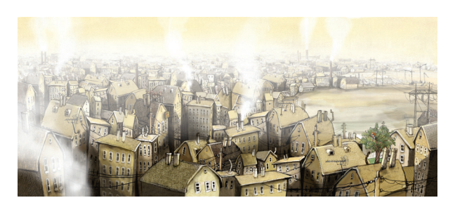
Ill. 5. Aisato, Fugl 2013.

I argue that the pictures not only reveal the book's psychological aspects but also that the visual complexity uncovers a social dimension. When analyzing the pictures one can see that they are arranged around a contrast between culture and nature. This contrast is already apparent in the endpapers. The front endpaper gives us an overview of a town (see Ill. 5). Aisato uses mainly brown colors, locking the town into a light fog. The only color in the picture is in the corner, portraying the girl sitting in a tree in the garden. Throughout the book, this green oasis and her grandfather's house stand in opposition to the world and the people surrounding her—that is, the society. This is especially evident