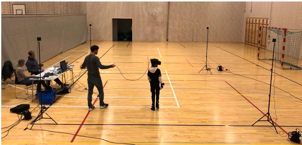
Fig. 2. The experimental scene and equipment.

position, the child was automatically taken to the first traffic task. Transitions between the traffic tasks worked seamlessly, as they had for the bike road tasks. If children were 'hit,' they were taken to the hold-deck before being given a second trial to complete the task. In order to have the same number of tasks for each child, only the first trial for each