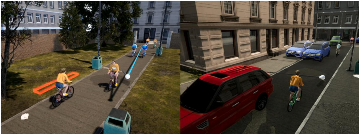
Fig. 1. Screenshots of the virtual bike-road environment (Bike road 3) and the virtual traffic environment (Traffic 3).