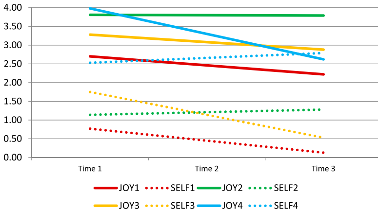
Figure 1. Development of mathematics-related enjoyment and self-efficacy over time.